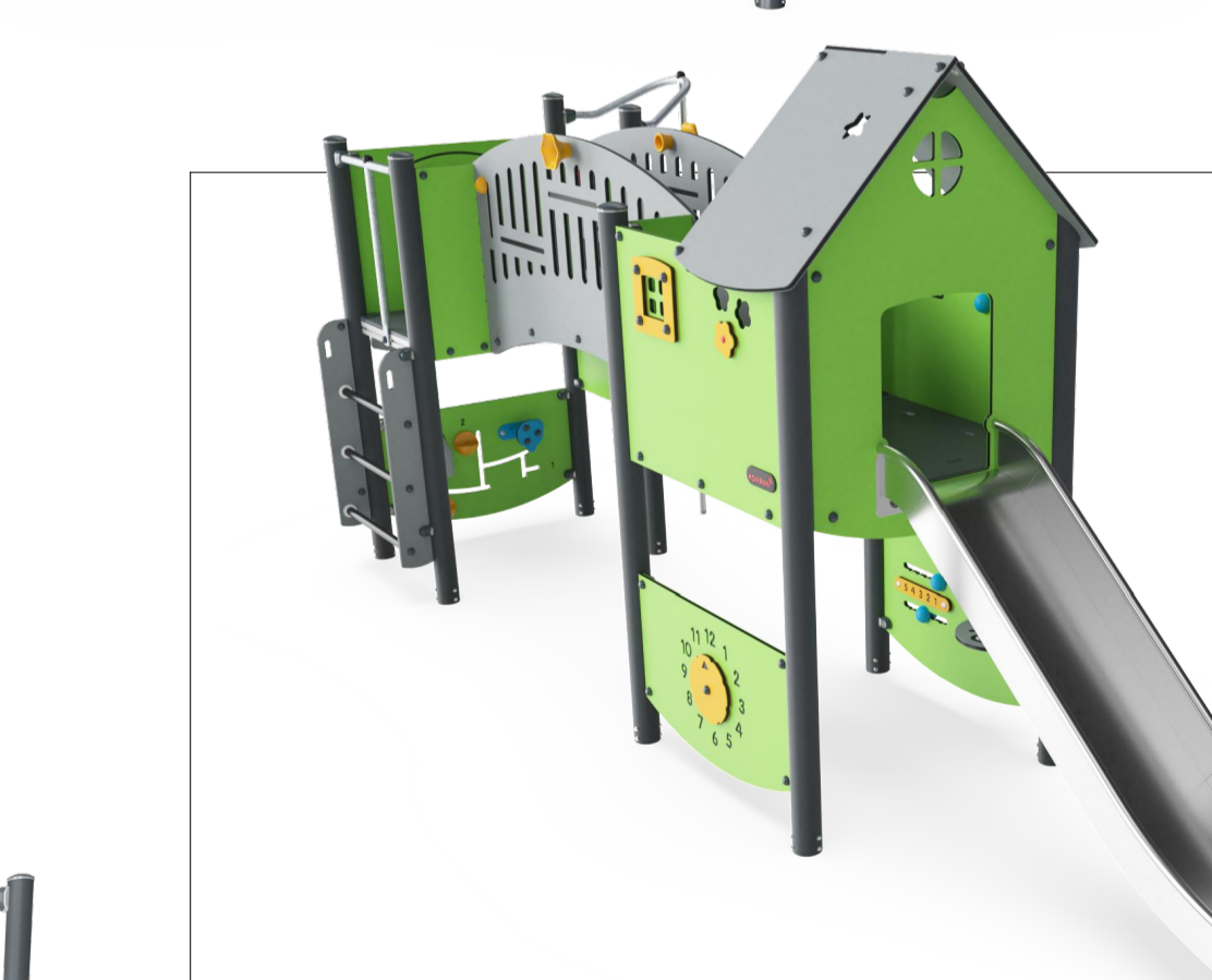
7. Double Multiplay Tower Ref PCM200121 20158233 Total height 251cm Fall height 129cm Age range 2-8 years DDA Accessible