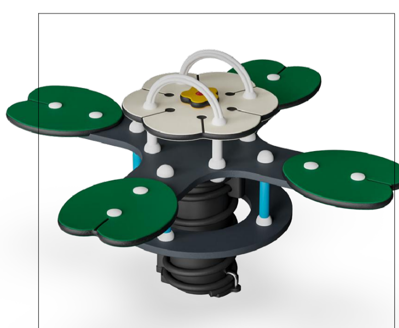
12. Water Lilies Springer Ref M17501 Total height 61cm Fall height 60cm Age range 2-6 years DDA Accessible