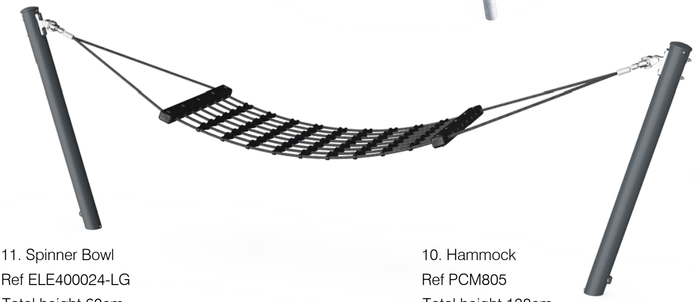
10. Hammock Ref PCM805 Total height 138cm Fall height 100cm Age range 3-12 years DDA Accessible