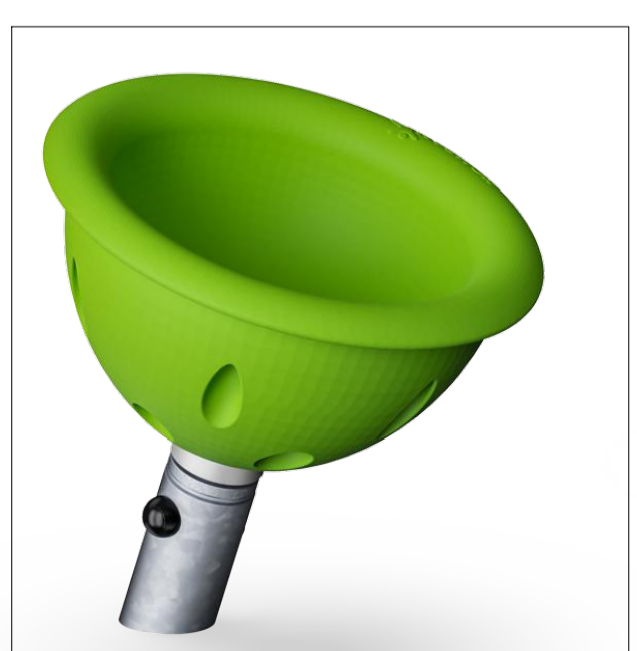
11. Spinner Bowl Ref ELE400024-LG Total height 60cm Fall height 100cm Age range 4-15 years DDA Accessible