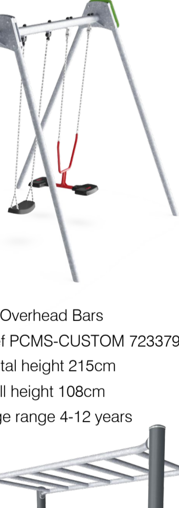
9. Overhead Bars Ref PCMS-CUSTOM 723379 Total height 215cm Fall height 108cm Age range 4-12 years