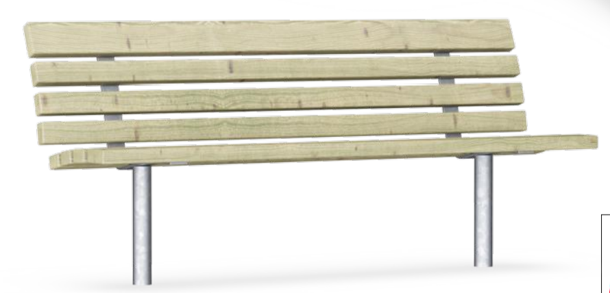
Pine Bench with Backrest Location TBC

Design assumes the site will be levelled by other (max. gradient 1:100), free draining and with good access. Quotation and design is submitted site unseen, we reserve the right, following a full site survey to amend the design appropriately. Areas and dimensions shown are critical for compliance with European safety standards EN1176 & EN1177, if in doubt ask. Grass areas should be well established prior to grass mat safety surfacing being laid.