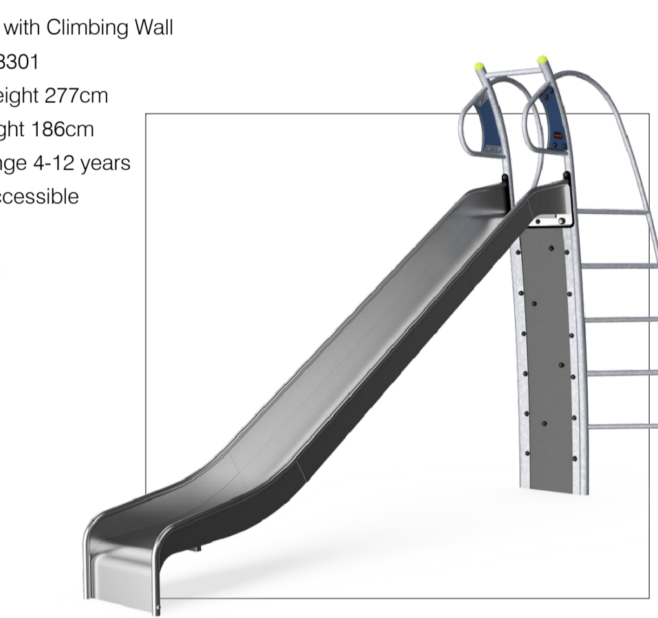
3. Slide with Climbing Wall Ref M33301 Total height 277cm Fall height 186cm Age range 4-12 years DDA Accessible