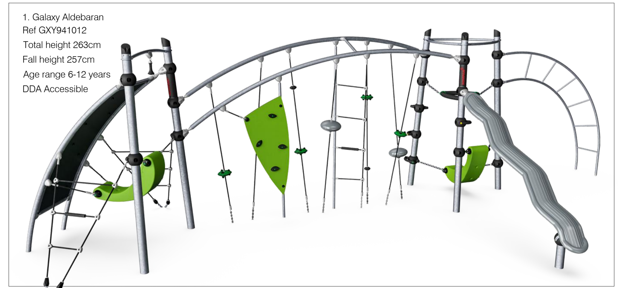
1. Galaxy Aldebaran Ref GXY941012 Total height 263cm Fall height 257cm Age range 6-12 years DDA Accessible